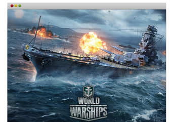
World of Warships