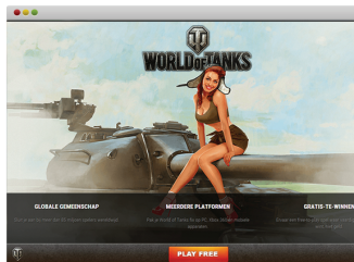
Registration Page for Players