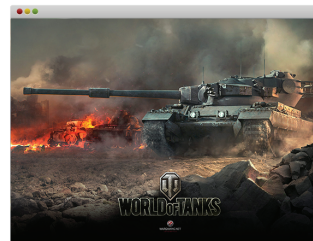
World of Tanks